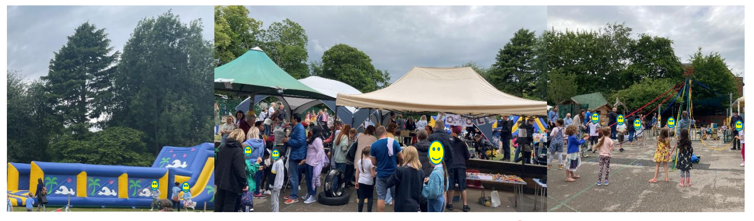
We can't wait to see you all again at our Christmas Fair!