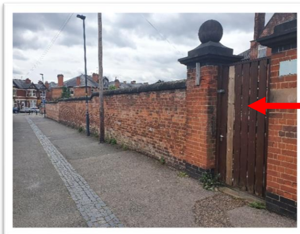
Entry Point Three (Gate on Newton's Walk)