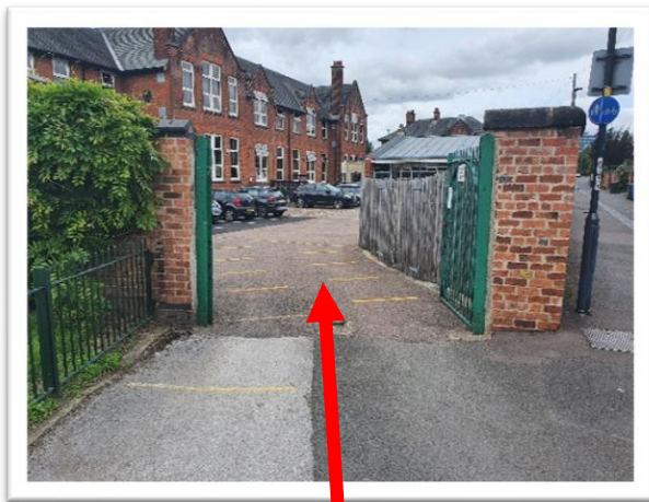
Entry Point One (Car Park Gate)

As stated earlier in the plan we will be implementing year group 'bubbles' across the school and in terms of entering school, this will assist with speed and effectiveness. It does mean, however, that we will need to have staggered drop off and collection times (+ one way systems) at the beginning and end of the day. We will also have to use three separate entry points. For the purposes of this plan, they will be called: