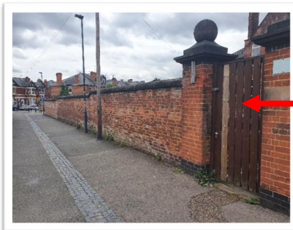
Entry Point Three (Gate on Newton's Walk)