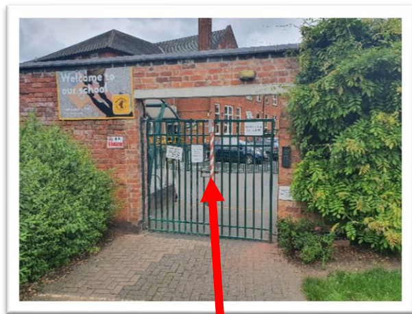
Entry Point Two (Pedestrian Gate)