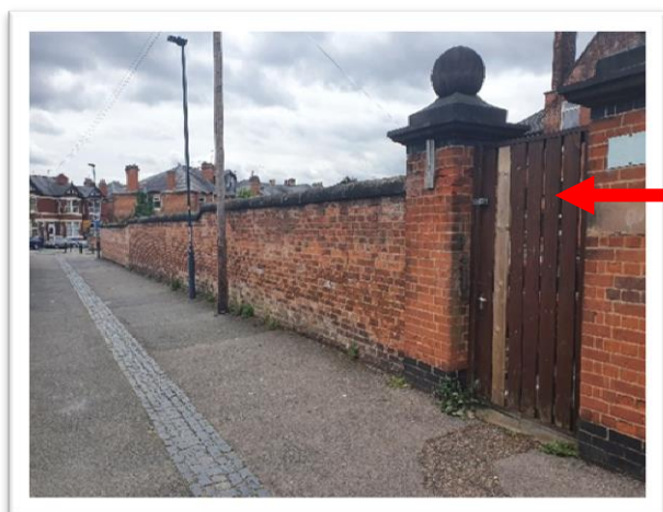
Entry Point Three (Gate on Newton's Walk)

The system we had in place for September will resume from 8 th March. Please make sure you are on time as getting 420 children in is made all the more difficult if families are late (or super early!).