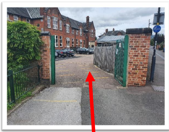
Entry Point One (Car Park Gate)