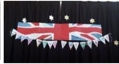
Highlights From This Half Term